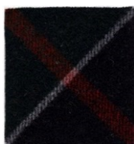
Royal Scots & KOSB