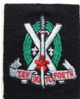
Tayforth University Officer Training Corps Beret Badge, Embroidered on black felt

These patches came in a few varieties of construction, the most common are woven or embroidered. Examples of both below.