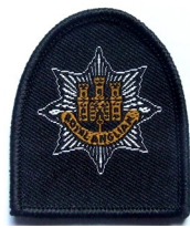
Royal Anglian Regiment ACF Beret Badge, woven example