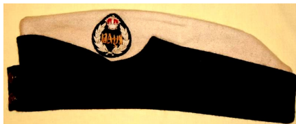
2nd Dragoons side cap badge, Embroidered